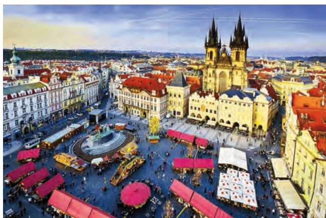
Old Town Square Easter Market

For drinks, try one of the famous Czech beers: Pilsner Urquell, Staropramen or Budvar. Or try a hot drink: honey wine (Medovina); mulled wine (svarak); hot chocolate (horka cokolada); or grog, a mixture of rum, water, lemon and sugar.