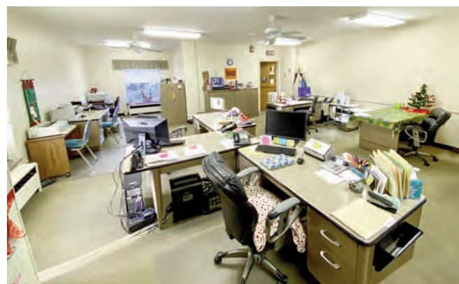
THE HOME OFFICE - CLEVELAND, OHIO

THE ANNUAL MEETING OF THE CZECH CATHOLIC UNION WILL BE HELD ON SATURDAY, APRIL 25, 2020 AT THE HOME OFFICE ON DOLLOFF ROAD IN CLEVELAND, OHIO. MEETING WILL BEGIN AT 1:00 PM. ALL MEMBERS ARE WELCOME. PLEASE CALL THE HOME OFFICE IF YOU PLAN TO ATTEND.