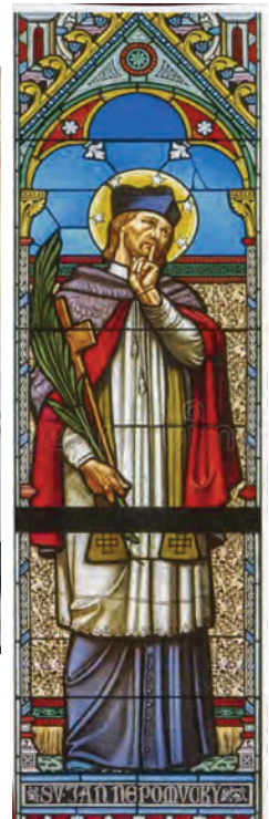
St. John Nepomuk feast day is May 16th

This church is located at the edge of Zdar and Sazavou, Czech Republic, near the historical border between Moravia and Bohemia.