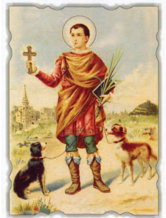
St. Vitus feast day is June 15th

Our flag is more than a patchwork of cloth. It is a constant reminder of the courage required to maintain our freedom, the liberty we enjoy in being self-governed and the loyalty and trust which unites us despite our individual differences. It is good that we pause to honor our nation's flag, for this act helps remind each of us that we are most blessed to be one nation, under God, indivisible, with liberty and justice for all.