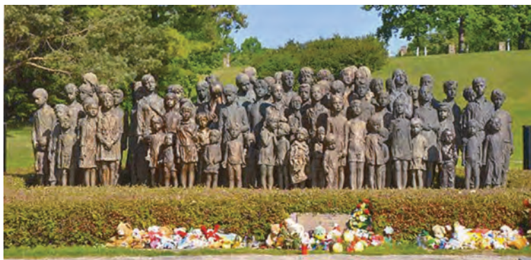
Memorial to the children of Lidice, killed at Chelmno.

On June 10, 1942, the German government destroyed the small village of Lidice, Czechoslovakia, killing every adult male and some 52 women. Most of the surviving women were taken to concentrations camps where they would be exterminated. Many of the children were sent to Chelmno (today's Poland) where they would be exterminated. Others were sent to Germany for re-education.