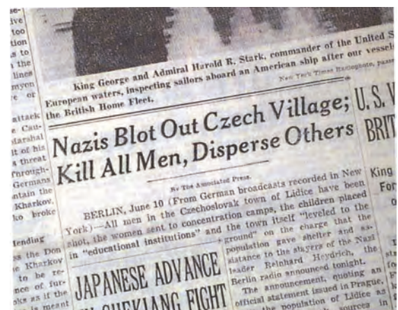
The entire village was completely destroyed.