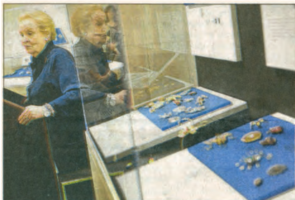
Former Secretary of State Madeleine Albright tells the stories behind her signature decorative pin collection on May 17, 2013, at the National Czech & Slovak Museum & Library in Cedar Rapids.

The President of the National Czech & Slovak Museum & Library believes it’s important to learn about the past (mentioned above) and bring it to a present day context to stop history from repeating itself “and to protect freedom and democracy”. There is a generation here that has no idea what communism was like so we have to be able to bring that to the forefront and be able to combat that so our precious freedom and democracy is never lost.