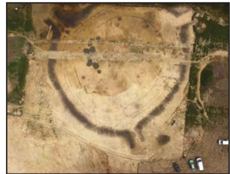
Ariel view of the Roundel

Researchers are still trying to understand the purpose and/or significance of the roundel. They believe the roundel was built by people that were part of the Stroked Pottery Culture, who were known for their farming villages in Central Europe, living between 4900 B.C. and 4400 B.C.